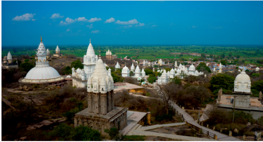
Clusters of white marble temples at Sonagiri present a stunning view