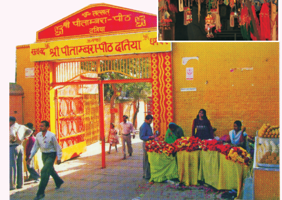
Peetambhara Peeth Temple, and (inset) trinkets being sold outside

The small town of Datia, mentioned in the Mahabharata as Daityavakra, has one of the most beautiful palaces in India - the seven-storeyed Bir Singh Palace, also called Govind Mandir Palace. Another significant landmark is the famous shaktipeeth , Peetambhara Peeth.