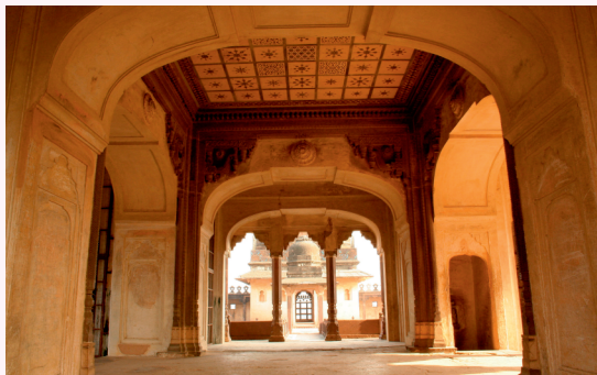
A row of arches in the palace

The art historian Percy Brown contends that the palace 'is conceived