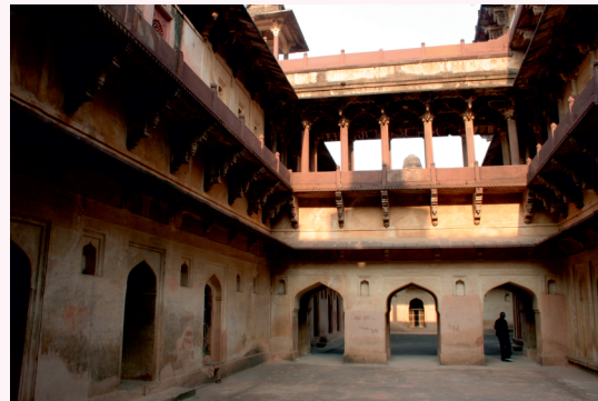
A view of a courtyard in the magnificent palace

Kama Sagar. Designed as a royal rest-house, the palace was meant to serve many purposes like holding prisoners, accommodating soldiers & guards, entertainment, hosting royal guests & secret meetings. The topmost floor had a watch-tower to track enemy movements. Today one may climb to the seventh floor and get a stunning view of the countryside around.