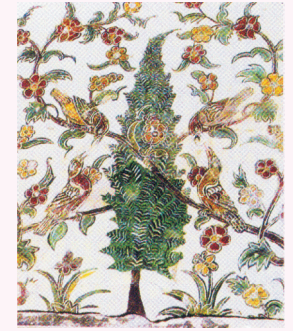
Beautiful murals and stucco work adorn the inside walls

Datia is noted for its many beautiful temples, and thus referred to as Laghu Vrindaban or 'small Vrindavan'. The most popular temple in Datia town is Peetambhara Peeth . A shaktipeeth , it enshrines two of the ten Mahavidyas, Dhumavati and Baglamukhi, and is much revered by the local population. It is thronged by devotees from far and wide, especially on Saturdays. Apart from the main shrine, the complex has several smaller shrines dedicated to other deities, including Parshuram, Hanuman and Kal Bhairav. Vankhadeshwar Temple, to Lord Shiva, is believed to date back to the time of the Mahabharata.